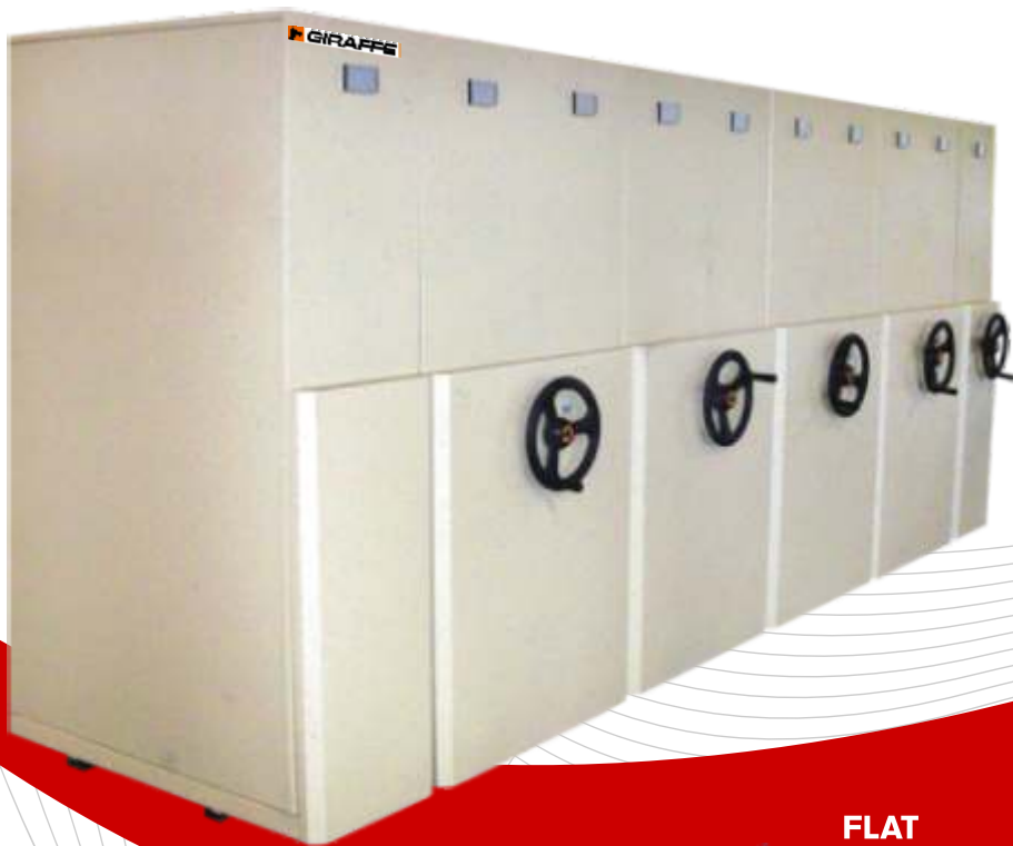
COMPACTORS / MOBILE RACKS